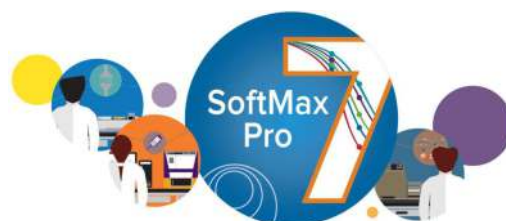
Empowered by SoftMax Pro® CFR 21 Part11 available