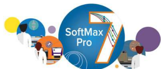
Empowered by SoftMax Pro® CFR 21 Part11 available